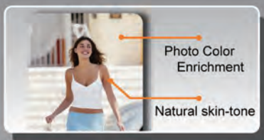
Retransfer Color Performance at Direct Print to Card Technology