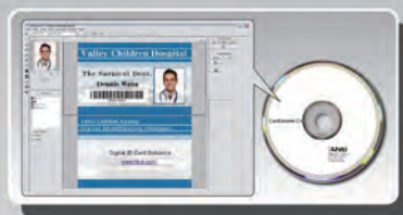
Free Bundle Software