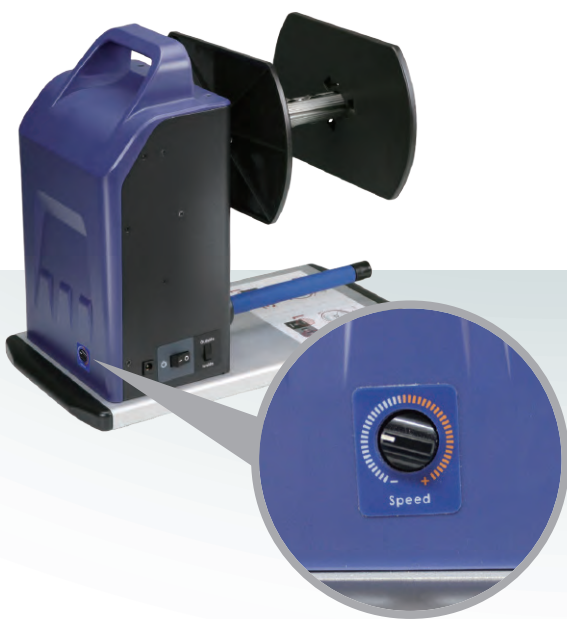
VR (Speed Adjustment)

Depending on the user's requirements, the rewinder can rewind "inside or outside" label rolls.