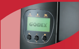
Upgraded Graphic LCD