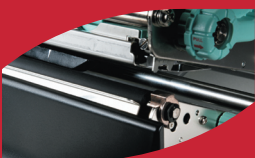
Adjustable sensor kit