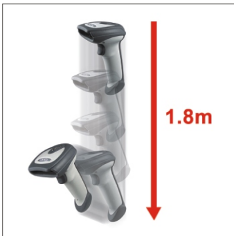
Durable design withstands multiple drops from 1.8 meters.