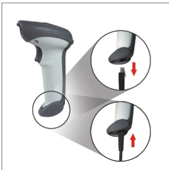
Snap-in, detachable interface cables design link to most popular hosts