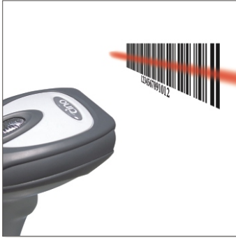
Superb bright aiming line for user visibility

www.LAAB.com.tw 02-2389-0101 04-2227-0088