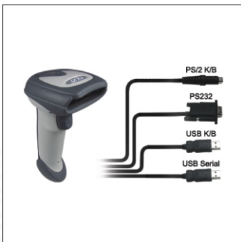
Compatible with most popular hosts by "all-in-one" universal interface